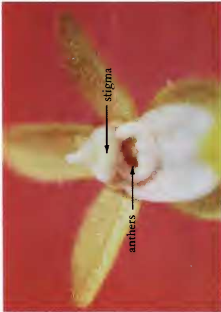
Fig. 1 Corolla removed